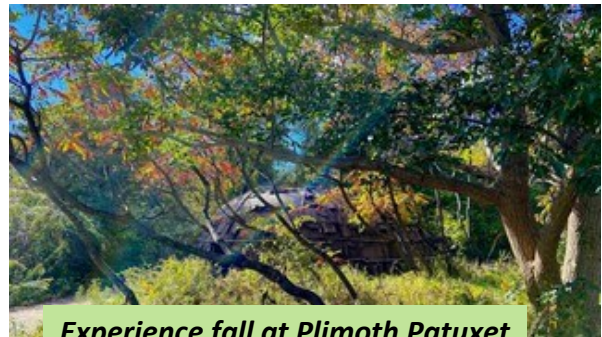
Experience fall at Plimoth Patuxet Museums

Visit https://thomascranelibrary.org/museum-zoo-passes/ to reserve your passes today.