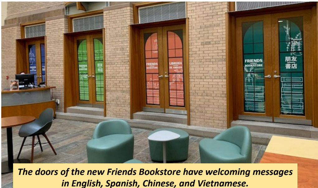
The doors of the new Friends Bookstore have welcoming messages in English, Spanish, Chinese, and Vietnamese.