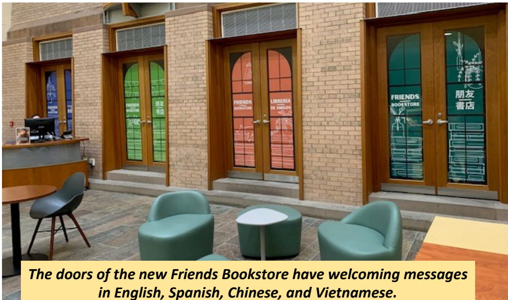
The doors of the new Friends Bookstore have welcoming messages in English, Spanish, Chinese, and Vietnamese.