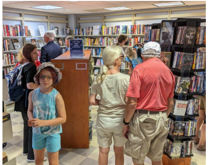
Patrons happily browsing the selection in the new Friends Bookstore