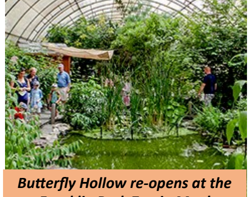
Franklin Park Zoo in May!