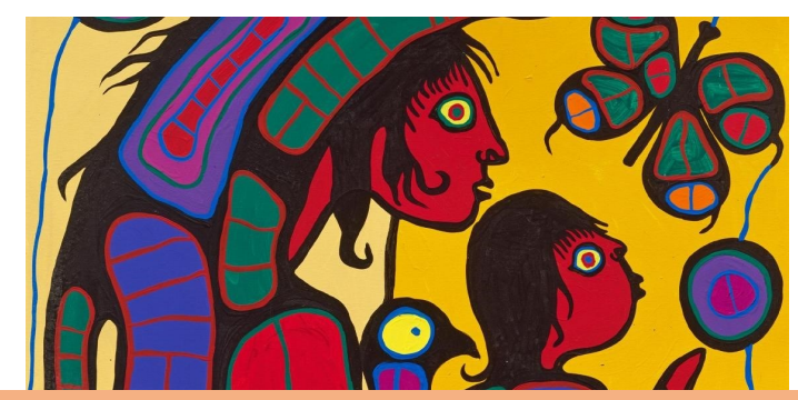
From Stories Artists Tell: Art of the Americas, the 20th Century. Reserve the MFA pass fordiscounted admission.